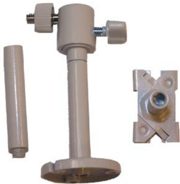
CWM0006: 2-6" MOUNT FOR WALL OR CEILING (recommended for indoor use)

MODELS CWM0006 - 2-6" MOUNT CWM0114 - 10" MOUNT CWM1100 - 7" MOUNT